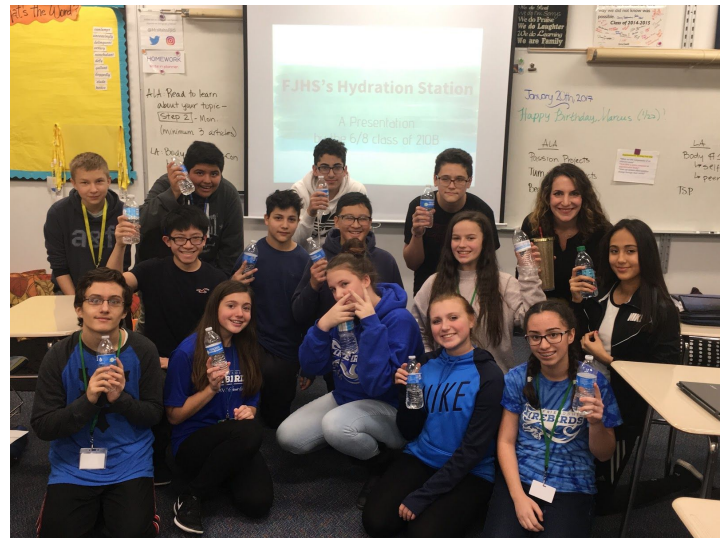
#fjhs210B hydration station squad

We are nearing the end of our argumentative writing unit. This has proven to be a difficult unit for many students, some of whom, at the beginning of the year, were writing a full essay as one paragraph. We have broken down all the components of a formal essay and they are confident with the organizational piece. The real struggle has been to locate convincing evidence that supports their reasons. We should be wrapping this unit up in the coming weeks, and I am certain they will see the great gains they have made this year compared with the pre-assessment they took week one. Seeing as this unit was mentally taxing, we will be taking a bit of a “break” next by reading one of my favorite YA books, Flipped .