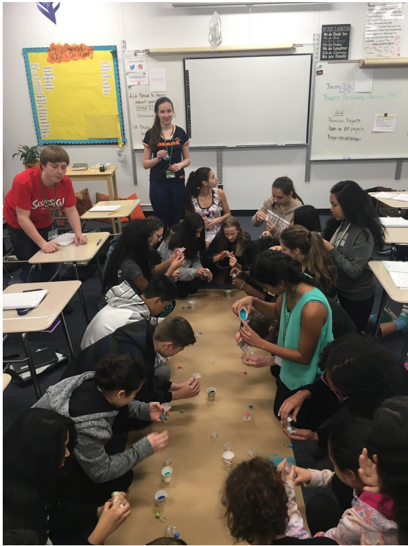
Kicking off Q3 creative projects with a little sand art!