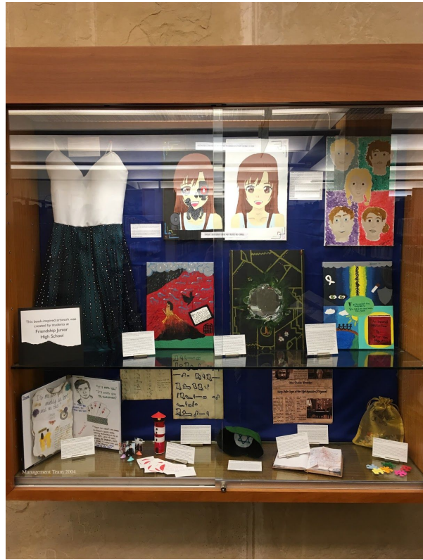
Projects on display at the MPPL