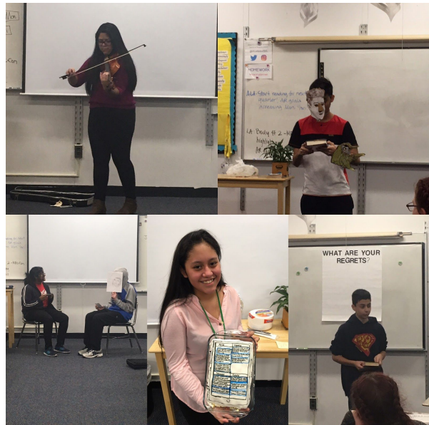
I can't wait to see what they come up with for Q3!