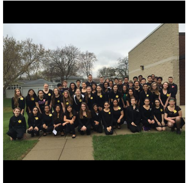
Last year's students on Holocaust Remembrance Day

We have begun reading the play adaptation of The Diary of Anne Frank , and students are enjoying taking on the roles and furthering their understanding of what life in hiding was like. We will do a few enrichment activities along the way, including a virtual tour of Anne Frank's hiding place in Amsterdam. Additionally, according to the United States Holocaust Memorial Museum, this Thursday is Holocaust Remembrance Day . At the start of the week, students will choose a victim of the Holocaust to learn about and memorialize. They will make a badge of honor and will be encouraged to wear it on Thursday as a way to commemorate those who perished or survived the Holocaust. FJHS's Holocaust Remembrance Day is a legacy of last year's students, and we hope to carry on the tradition with this year's 8th grade class.